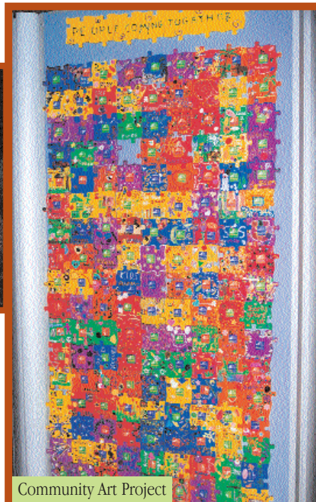
Community Art Project