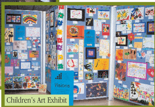
Children's Art Exhibit